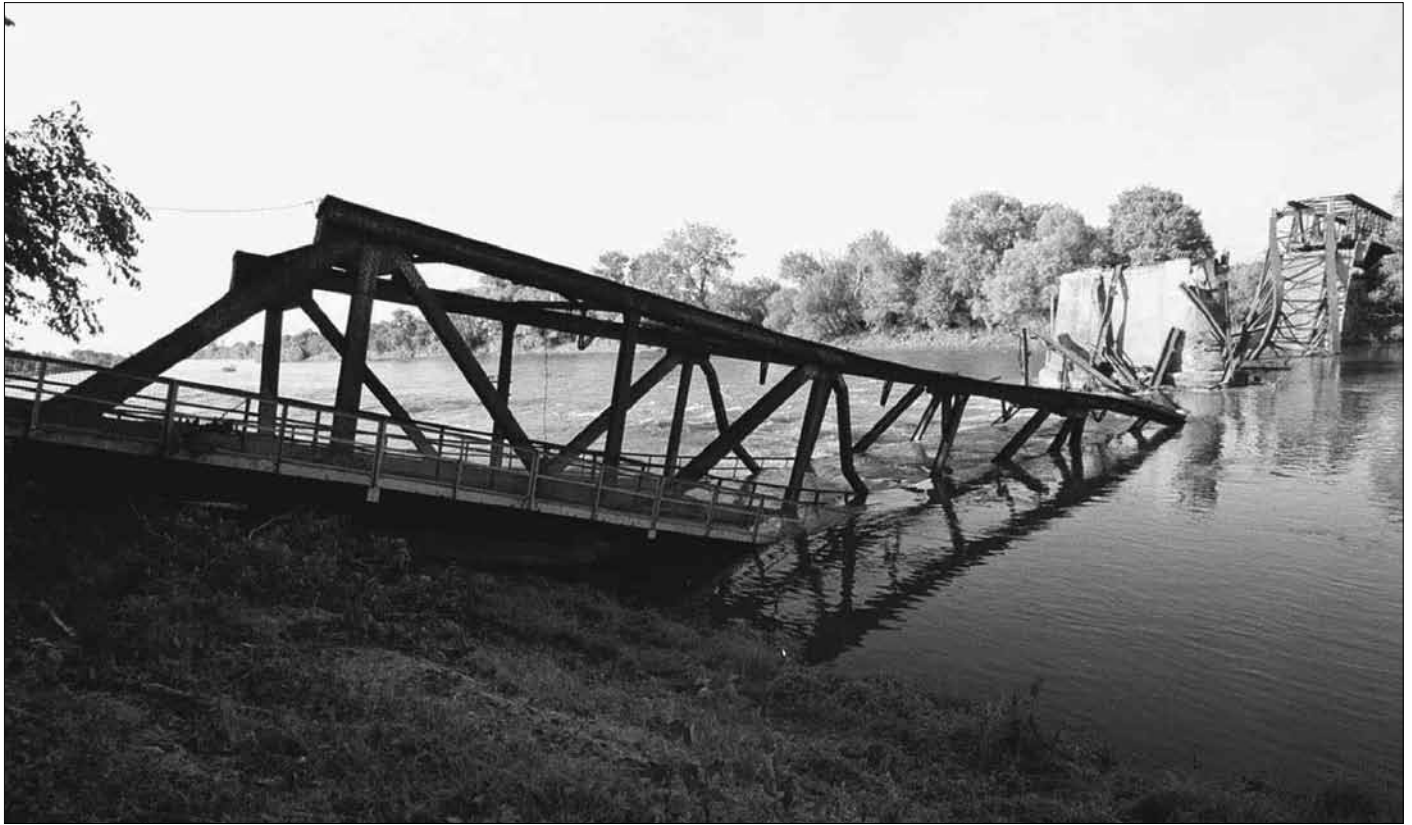
The bridge of Varvarin.