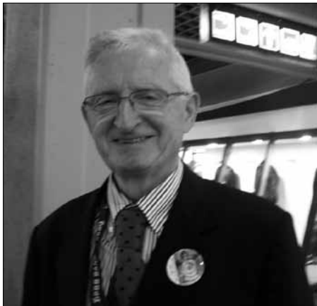
Živadin Jovanovic (picture ev)

Interview with Živadin Jovanovic, Former Minister of Foreign Affairs of the Federal Republic of Yugoslavia, presently Chairman of the Belgrade Forum for a World of Equals