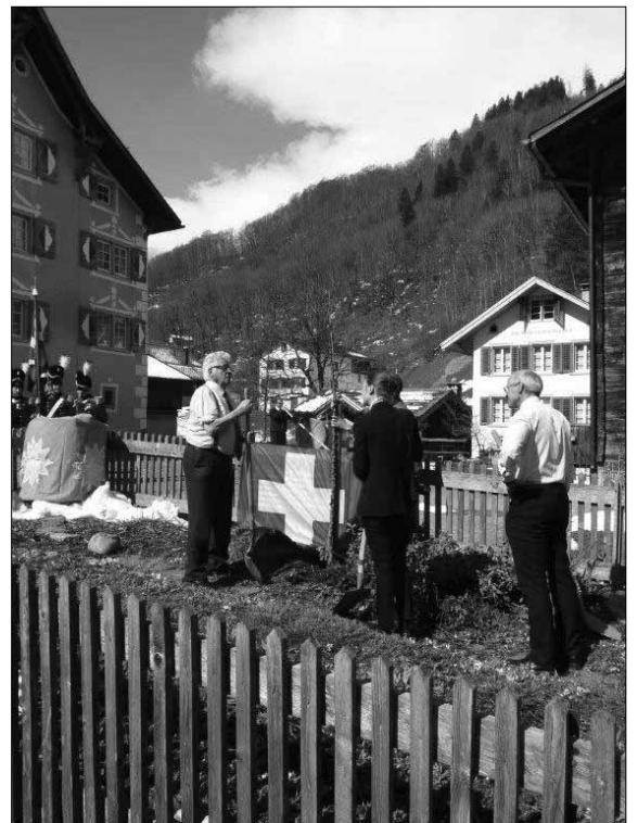
The apple tree with the donated slate and all contributors to this successful occasion. (picture mb)

The tenth tree has now been planted. More shall follow all over Switzerland, until the 27 th Bernese Rose is to be planted in Moscow in 2015, of which the 26 Swiss trees have been grafted. A work of art that is connecting peoples and that will accomplish the friendship of both countries. •