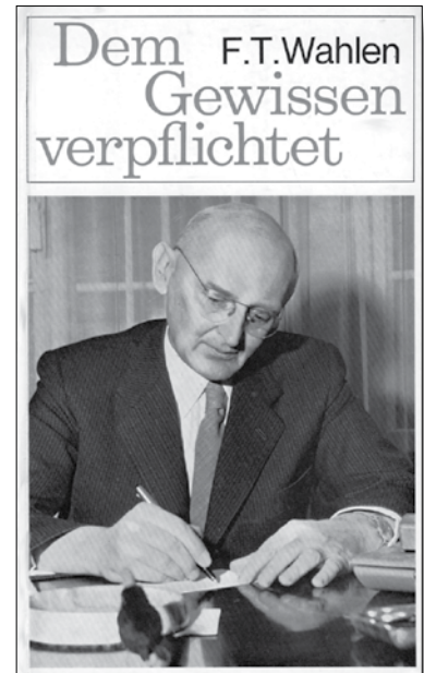
Bound by conscience