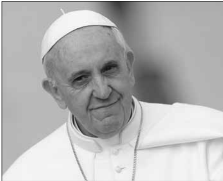
Holy Father Francis

Homily of Holy Father Francis on the “Arena” sports camp, Salina Quarter (Lampedusa Island) on 8 July 2013