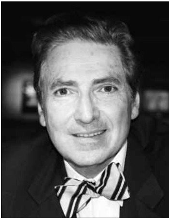
Alfred de Zayas

by Prof Dr iur and Dr phil Alfred de Zayas *