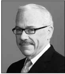
Bob Barr (picture ma)

Zurich, Switzerland, is a major international financial center sitting at the northern tip of its namesake lake. Beginning in 1987 and continuing until 1992, however, this beautiful Swiss city was home to "Needle Park," an exper-