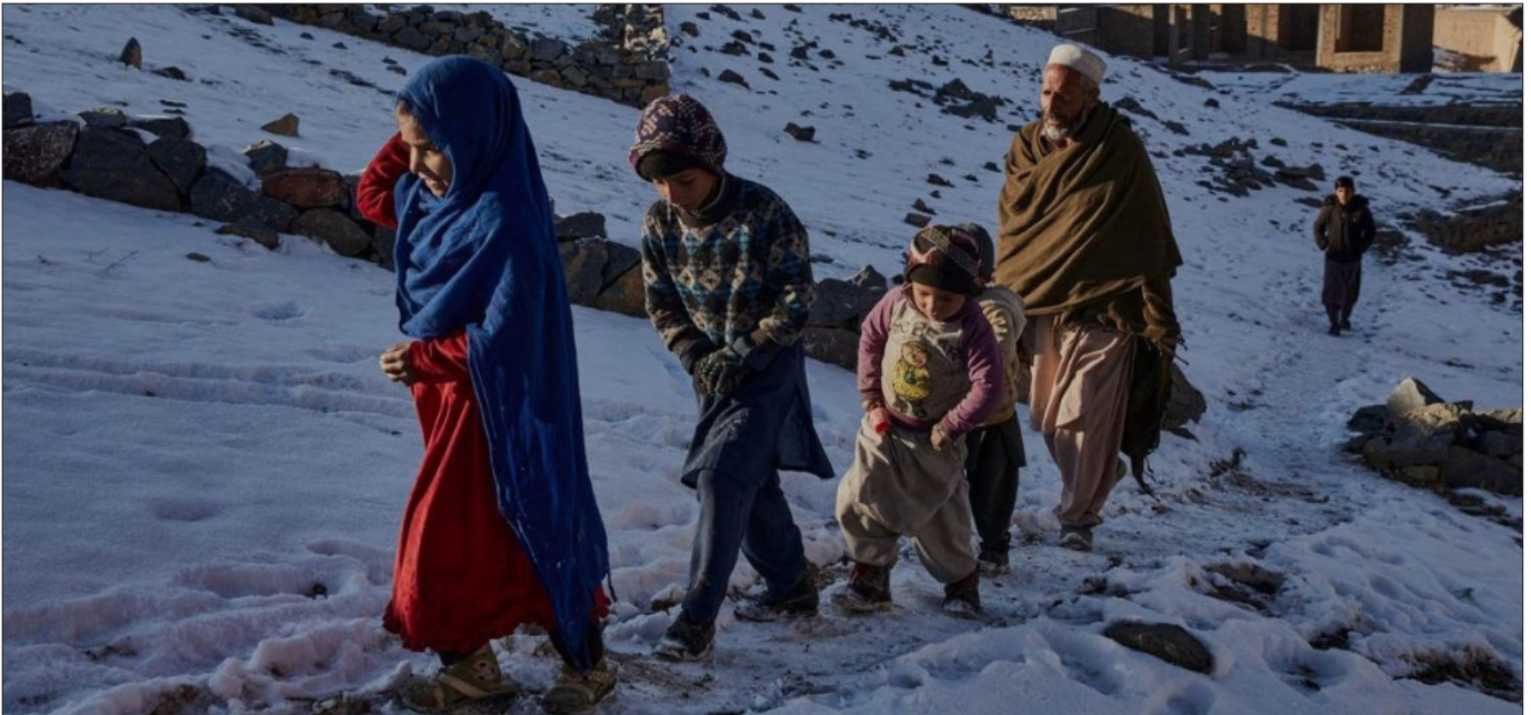
Families in search of water during a strong winter in Kabul, Afghanistan.

15 August is a public holiday in Afghanistan. On this day in 2021, after 20 years of supporting a corrupt government installed by the West, NATO troops left the country, leaving power to the Taliban who had previously taken control of it. Although Afghanistan is rich in natural resources, abject poverty and constant famine still prevail. It is a sign of cynicism second to none that sanctions that violate international law are still being maintained, having been imposed after the Taliban came to power and which UN Secretary-General António Guterres called for to be lifted in an urgent appeal as early as 2022. The ongoing drought is