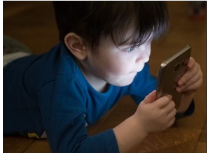
Spellbound in front of the screen! Today, every society faces the urgent task of how to protect its young people from the negative consequences of digitalisation.

A particularly disgusting example was (in our latitudes), topical a year ago, the so-called blackout challenge . It was an instructional video on how to strangle oneself with a certain knot that – done cor-