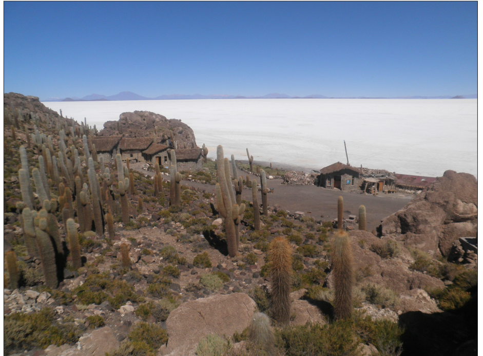
At 10,000 square kilometres, the Salar de Uyuni in south-west Bolivia is the largest salt lake in the world. (Picture ma)

Bolivia is one of the countries with the largest share of the world's lithium resources. Until recently, it was estimated to have 21 million tons. In recent months it has become known that the figure is as high as 23 million tons. There are more than 20 salt lakes in Bolivia, and the figure of 23 million tons refers to only three