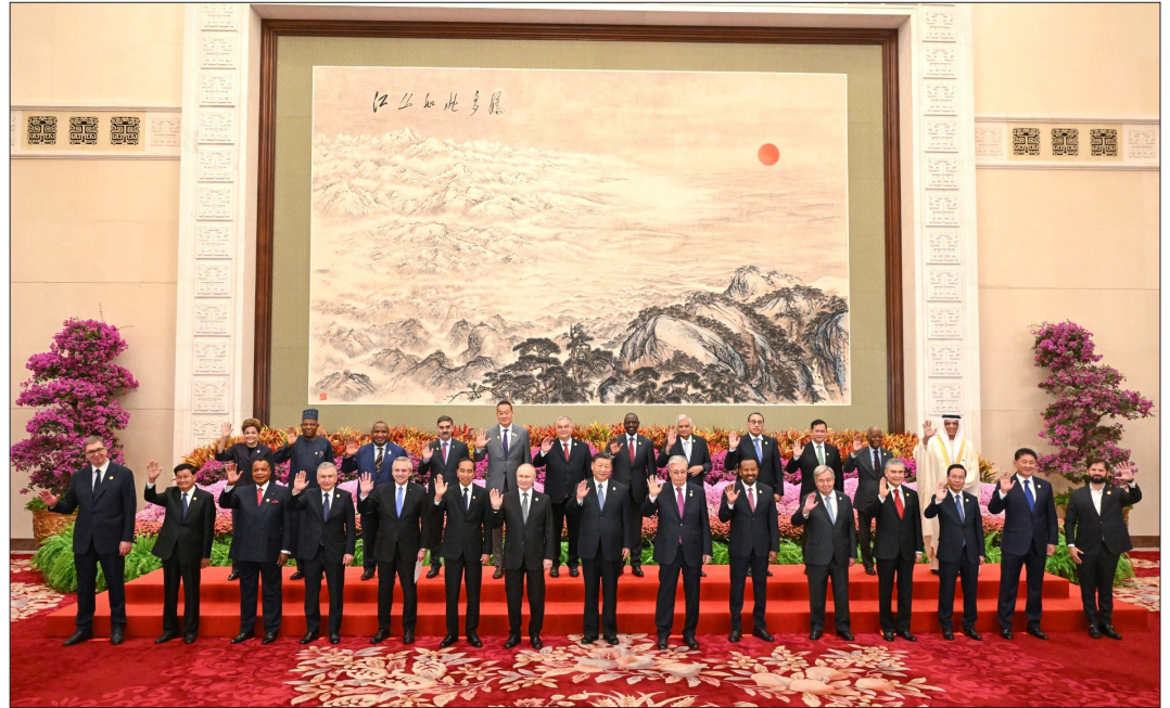
Heads of delegation at the III Silk Road Summit in Beijing at the group photo.

Now, in a speech from the Oval Office, US President Biden mentioned Hamas and